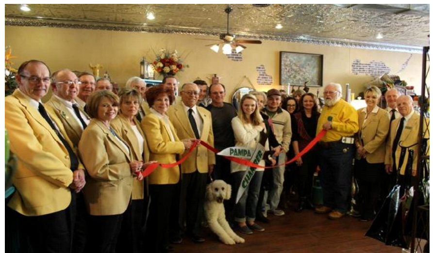
Gold Coating of Finley March 6, 2015