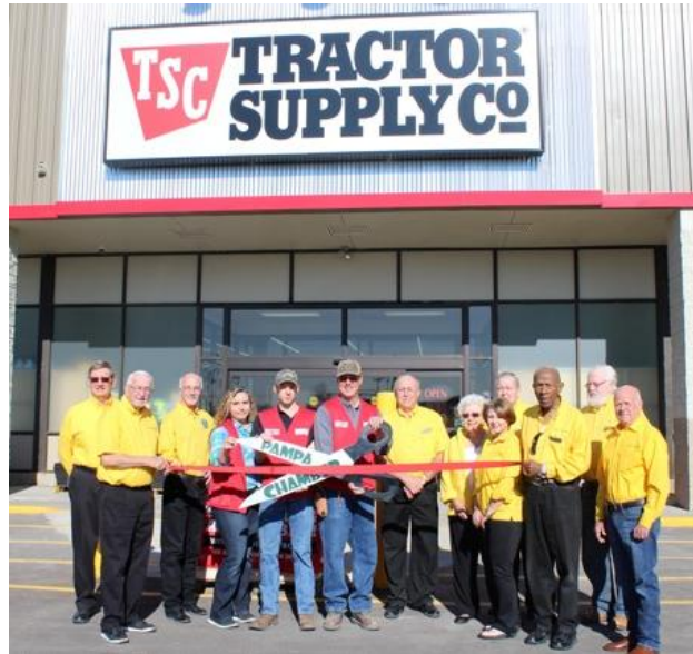
Gold Coating March 28, 2015